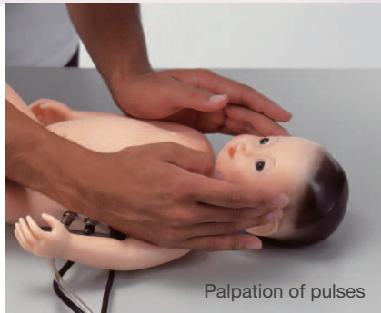
Palpation of pulses