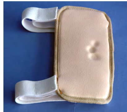
2+ Moderate pitting Indentations with approx. 4mm depth