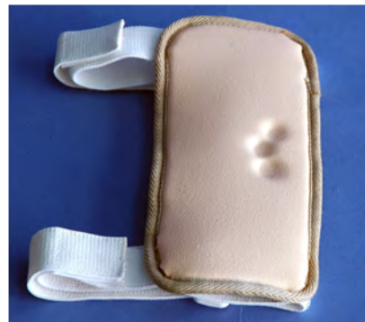
3+ Deep pitting Veins, bones and joints are indistinct because of swell. Indentations with approx. 6mm depth.