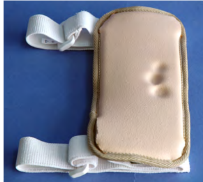
4+ Very deep pitting Indentations with approx. 8mm depth.