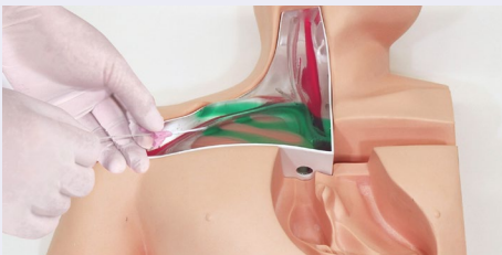
Transparent anatomical block