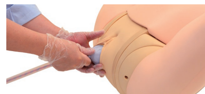
Delivery of the placenta