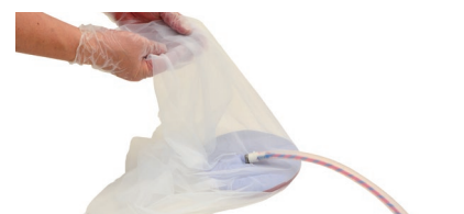
Inspection of placenta and velamen