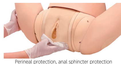
Perineal protection, anal sphincter protection