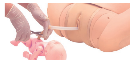
Clamping, tying and cutting of the umbilical cord