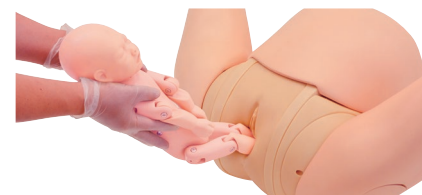
Smooth delivery of the baby