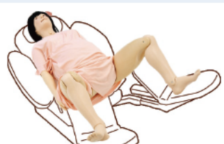
Compatible with birthing chairs