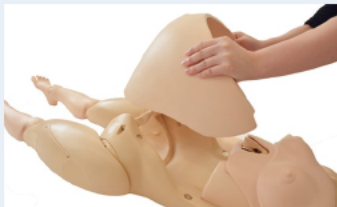
One-touch interchangeable parts