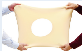
Durable yet realistically elastic