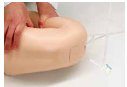
CSF pressure measurement