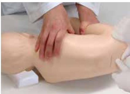
Palpation of landmarks