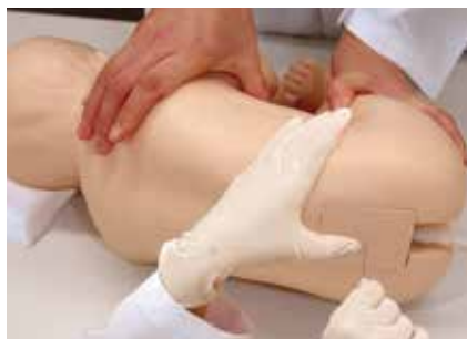
Lumbar puncture and CSF collection