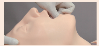
Mouth Opening - Normal - Intermediate - Difficult