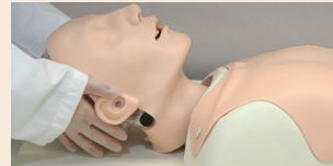
Neck Flexibility (Life-like jaw movement)