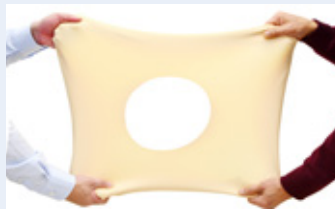
Durable yet realistically elastic