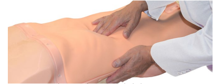
Supple, resilient and delicate texture