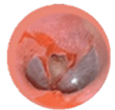
Traumatic tympanic membrane perforation