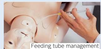
Feeding tube management