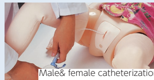
Male &amp; female catheterization