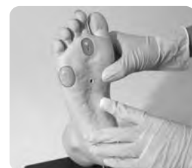
Observations of the anatomical positions