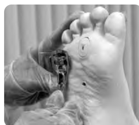
Trimming and removal of the callosity