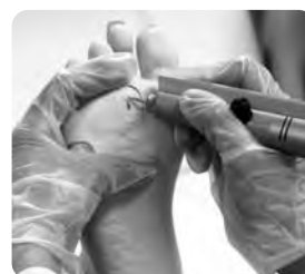
Trimming and removal of the corn