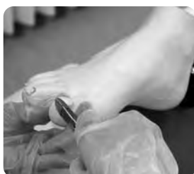
Trimming and clipping of toe nail