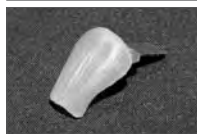
Toe nail A (thickened ingrown nail)