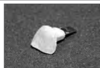
Toe nail B (thickened nail with ringworm)