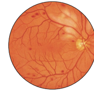
◀ Hypertensive retinopathy