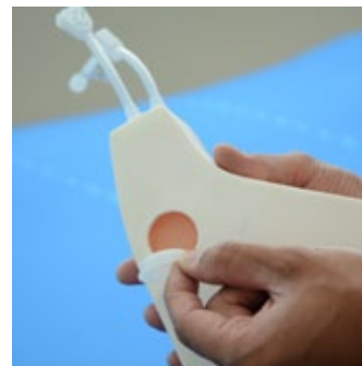
1. Remove the lid behind the pad to become a landmark puncture pad.

⚠ WARNING Do not open the lid for "ultrasound use."