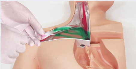
Transparent anatomical block