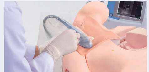
Ultrasound puncture pad