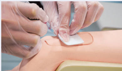
Radial Arterial Puncture