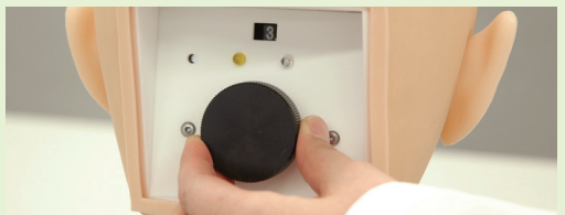
Quick switching between cases