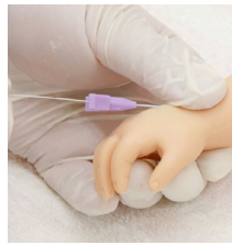
Intravenous catheter insertion (vein localization via transillumination is possible)