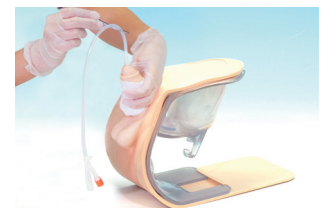
Pass of catheter can be observed through transparent bladder reservoir