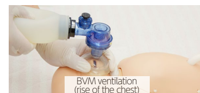
BVM ventilation (rise of the chest)