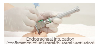
Endotracheal intubation (confirmation of unilateral/bilateral ventilation)