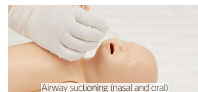
Airway suctioning (nasal and oral)