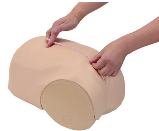
Measurement of fundal height