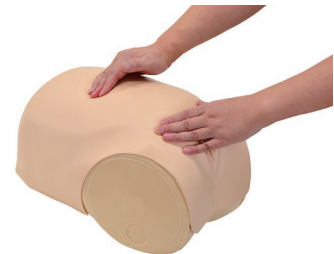
Palpation of uterine fundus