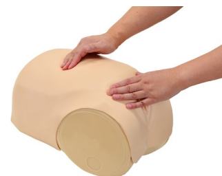
Palpation of uterine fundus