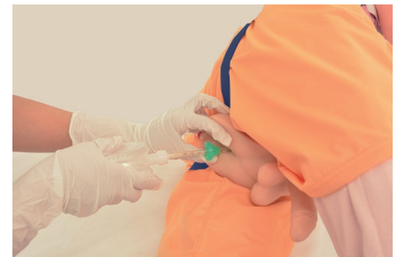
Realistic resistance to the catheter