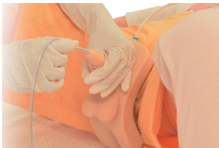
The catheter can be inserted when the penis is held at the right angle.