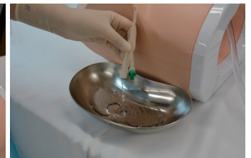
Confirmation of discharge of urine