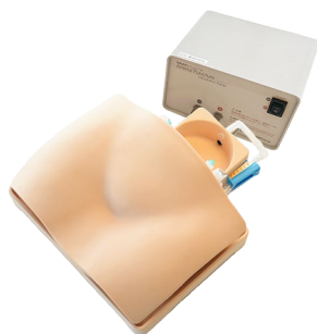
Hands-on femoral arterial access training