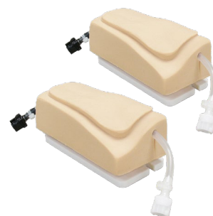
Master Ultrasound-Guided Radial Arterial Puncture