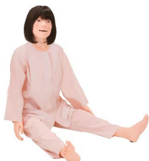
An integrated patient care simulator for a wide range of trainees, from undergraduates to professionals. MW25 Patient Care Simulator "Yaye" 11404-000