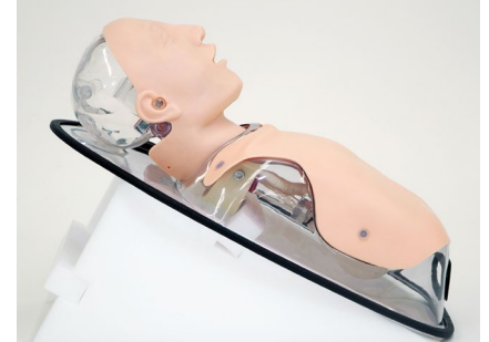
The manikin can be set in Fowler's position.