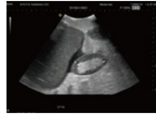
Right upper abdominal bleeding