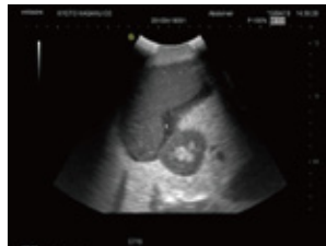
Left upper abdominal bleeding