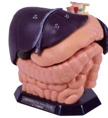
Full set includes anatomical model "ECHO-ZOU"