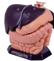
Full set includes anatomical model ECHO-ZOU (11224-000)