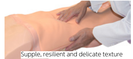
Supple, resilient and delicate texture